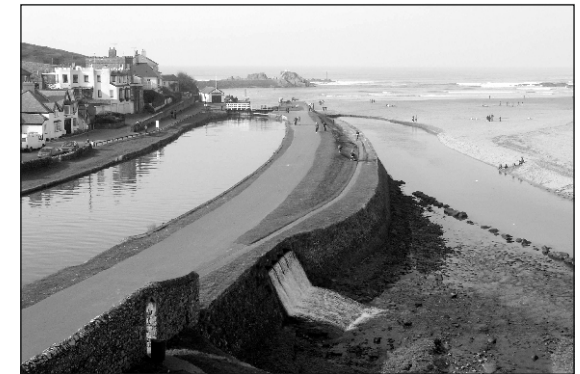
The sea-lock overlooking the Breakwater and Summerleaze beach