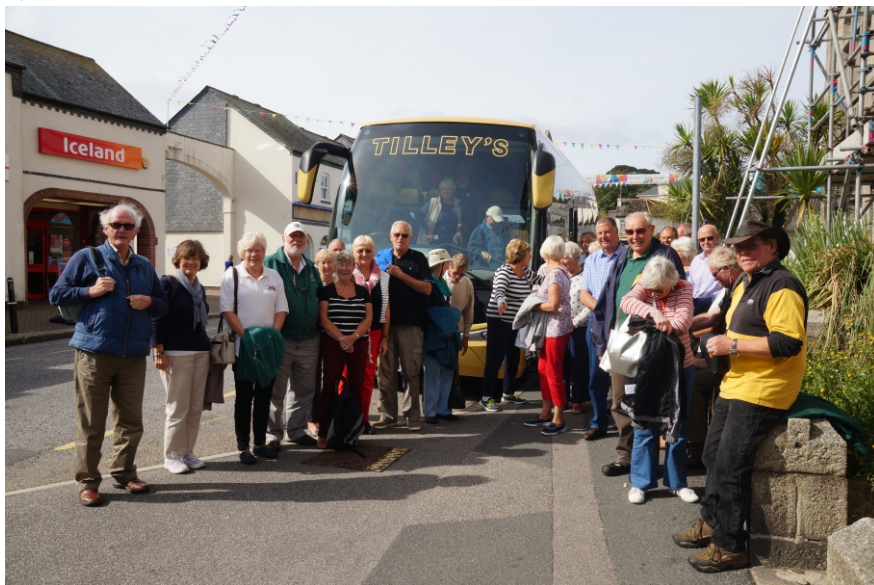
Bude Canal and Harbour Society Tall Ships excursion to Falmouth.

This year the society's annual outing was to Falmouth to view the Tall Ships Regatta fleet gathered in the port prior to the start of the race to Royal Greenwich, London.