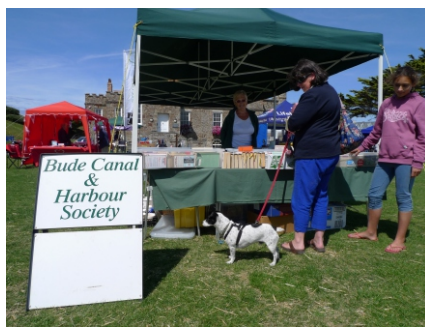
Bude Carnival stall