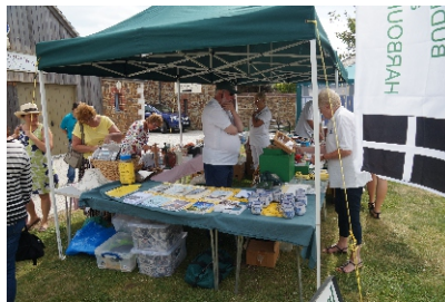
Society Stall at Heritage day

The weekend also marked the opening of The Cone, a new ice cream and milkshake bar in The Castle, and also gave many more people the chance to try out Cafe Limelight and see the latest exhibitions in the galleries.