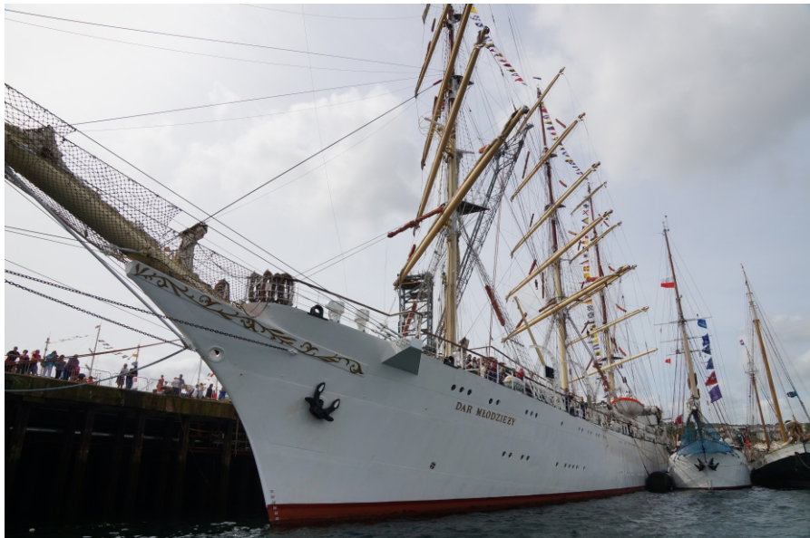
Polish Sail Training vessel Dar Młodzieży

close-up view of these beautiful and majestic vessels. One of these was the Polish Sail Training vessel "DAR MŁODZIEZY" which was one of six sister ships built for the Polish and Russian Navy and launched in 1982 in Gdansk. It is 108.81 metres long with 62 metre high masts. A very impressive sight when in full sail.