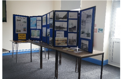
Canal information Display

The weekend also marked the opening of The Cone, a new ice cream and milkshake bar in The Castle, and also gave many more people the chance to try out Cafe Limelight and see the latest exhibitions in the galleries.