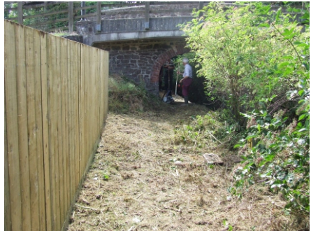
Clear view of Burmsdon Bridge

A survey of the work done on the section near Puckland was carried out with the help of Neal Reeve of the South West Lakes Trust for which we are very grateful confirming that the work carried out had in fact improved the habitat for insect foraging by bats.