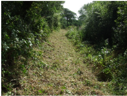
Path after clearing