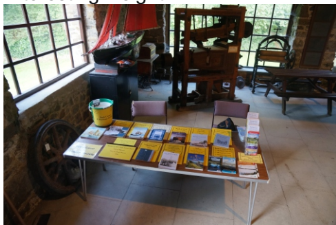
Barge workshop, Hele Bridge