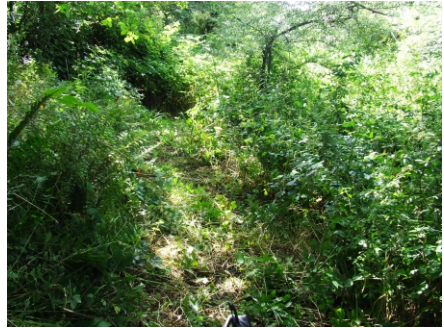
Overgrown permissive path