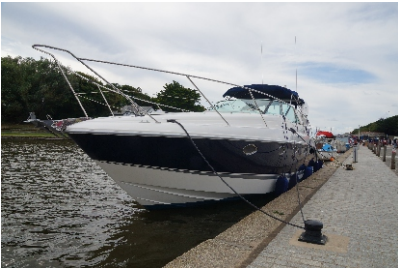
Visiting boat "Ocean Boulevard"

Hundreds of families came to the area to enjoy entertainment supplied by local performers and community groups. There were local brass bands and community choirs, and performers from the Big Up Bude talent show. Bude Wave Riders ran a surf simulator, and the Surf Life Saving Club an inflatable slide. Local food producers tempted visitors with all their delicious wares, whilst Made with Love provided an excellent Hog Roast and Paella.