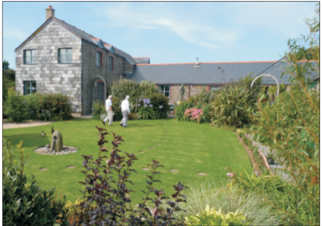
A fine view of Barn House.