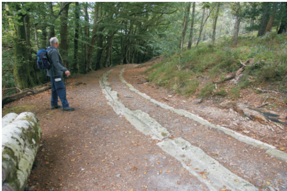
The contrasting beauty of the wooded areas.

woodland the route continued onwards along a permissive path, which opened in 2007 passing through fields and apple orchards, which were quite a contrast to the open moorland, which we saw at the start of our walk.