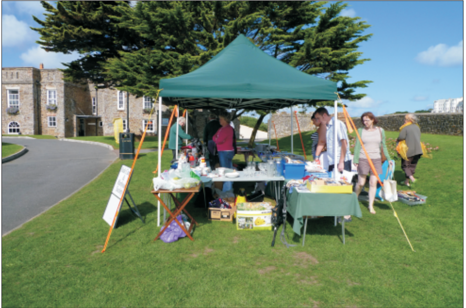
A stall on Castle Green attracts interest at the RNLI event.