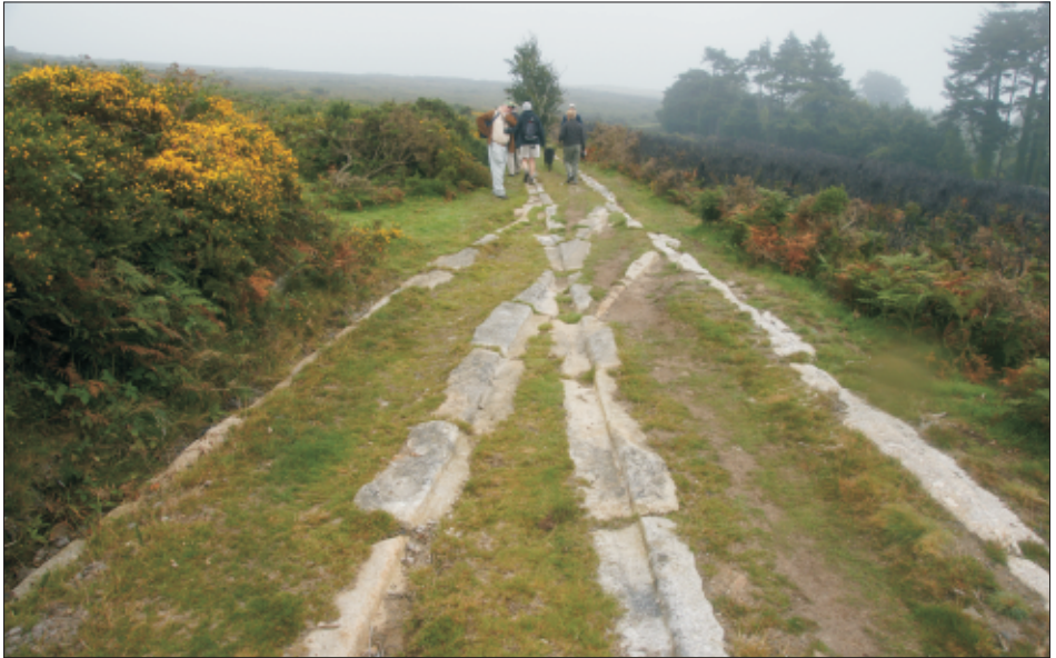
A fine view of the granite tramway showing a junction.