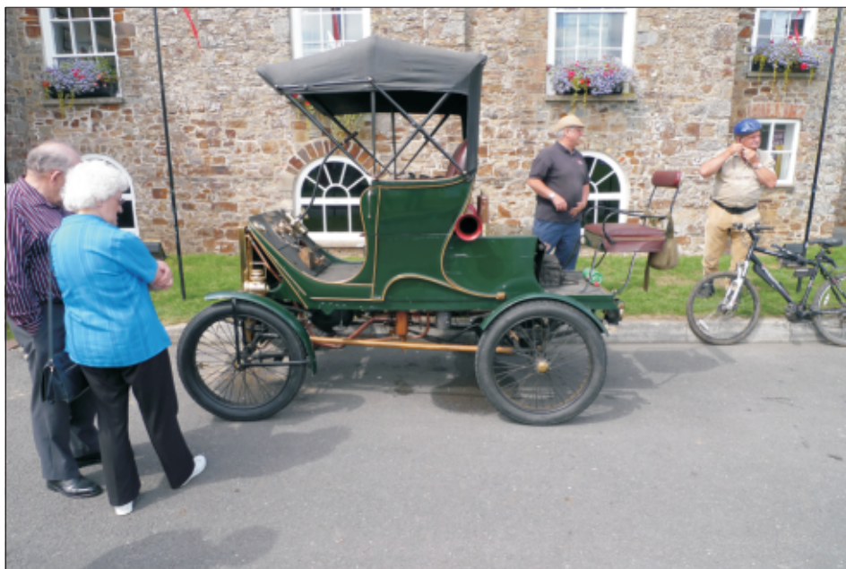
An old jalopy and admirers.

All the vehicles on show attracted much attention.